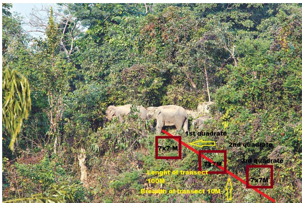
Figure 2. Schematic diagram of a transect line with quadratic sample sites in the TWS. Each transect included 36 small quadratic sample sites where all plants were recorded

For the data analyses, we used various software packages, such as biological diversity calculation software, SPSS software version 26 (IBM Corp, Chicago, USA), ArcGIS software version 10.7.1 (Esri, California, USA), and Adobe Photoshop software. We used different software products to analyse our datasets for comparison, differentiation, and uniformities and finally, we constructed graphical and tabular representations as outputs. We calculated five types of diversity indices (e.g., Shannon's index, Simpson's index, dominance index, richness, and evenness indices) with the aid of biological diversity calculation software to assess fodder species abundances across sites, as well as site quality. By using SPSS software, we combined multifold statistical analyses with descriptive statistics, comparative statistics and inferential statistics. We used the mean \pm SD to determine a variable's average value and used a statistically significant value of P \leq 0.05 . Finally, we used ArcGIS and Photoshop software to construct site maps.