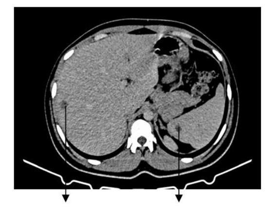
Fig. 4. Abscess over liver and spleen

mellitus, chronic kidney disease, post organ transplant, patient on steroids .Among these the most common predisposing factor is diabetes mellitus [8]. The incubation period range from 1 to 21 days [9]. The common presentation swelling over multiple sites resembling abscess over subcutaneous region, multiple joints involving knee, ankle, wrist. A recent study from Australia suggested that the most common involvement in meliosis is bone and joint, with elevated erythrocyte sedimentation rate and Creactive protein [10]. The disease rapidly progresses to septic shock, multiorgan failure and death.