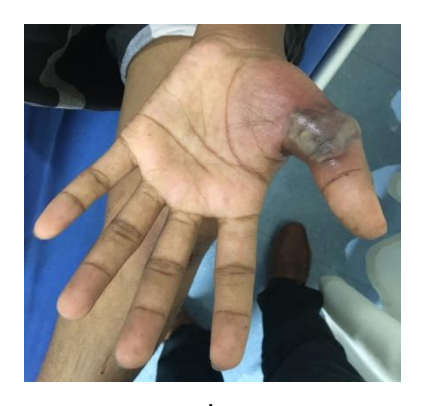
Fig. 2. Abscess over Left Hand