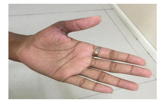
Fig. 5. Resolution of abscess in hand