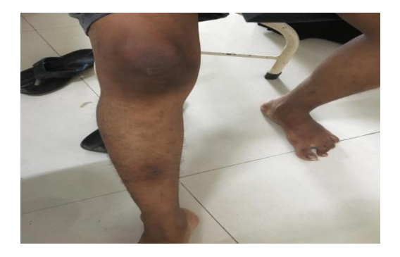
Fig. 6. Resolution of abscess in leg

The diagnosis is mainly any patient presents you with fever, joint pain, multiple swelling, and symptoms of pneumonia like cough, cold and breathlessness with history of soil contact meliodosis should be ruled out. Sample should be sent for routine investigation and 2 samples for blood culture and sensitivity and pus culture and sensitivity before the start of antibiotics.