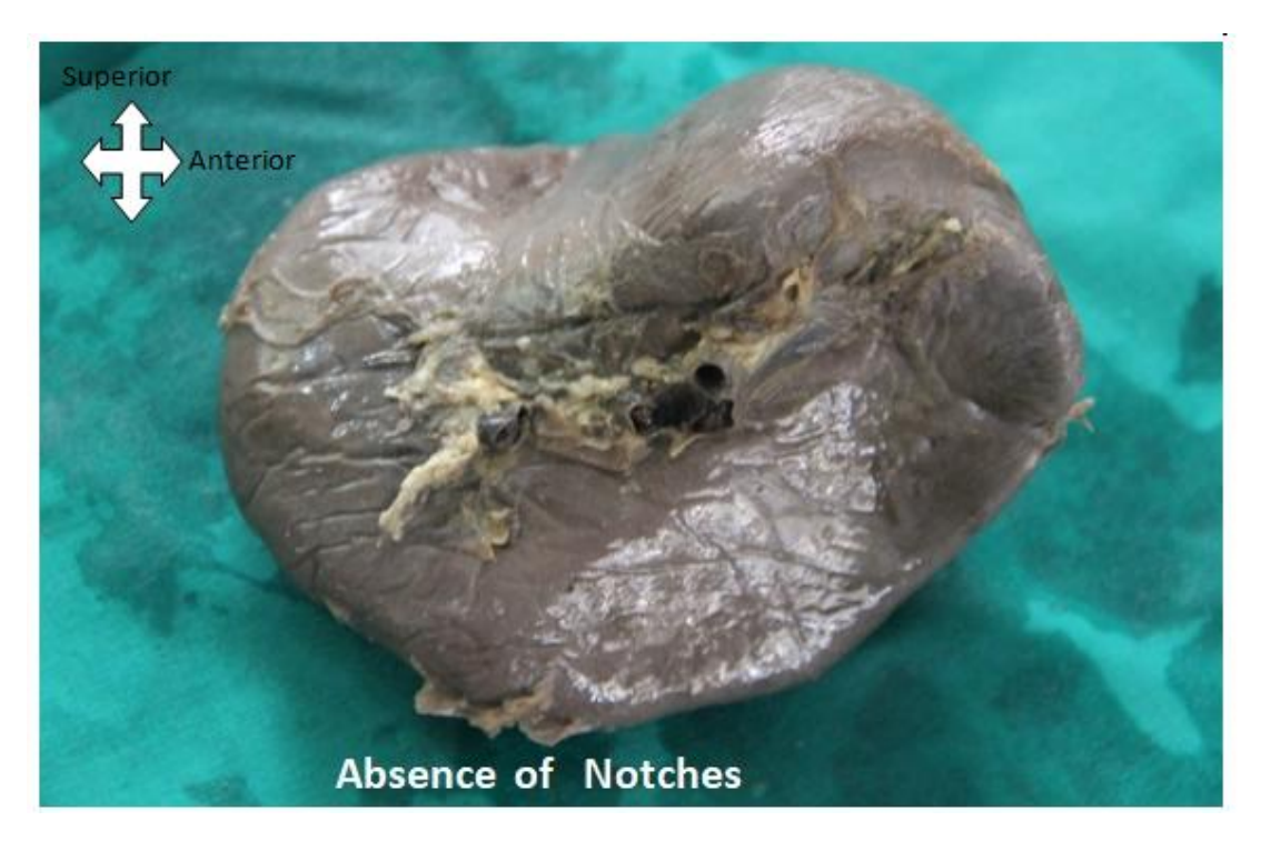
Fig. 1. Absence of Notches over the spleen