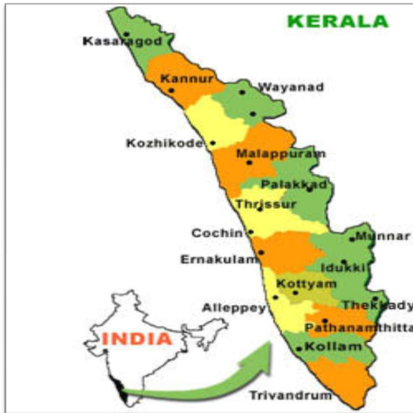
Fig. 1. Study area-Kerala

medicinal value, most of which grow in wild conditions, whereas only a few are cultivated [1]. The traditional use of medicinal plants has been an ancient practice among human populations for a long time with traditional knowledge or information being transferred from generation to generation. Ethnomedicinal surveys are conducted to document the practice of herbal medicine among rural and ethnic communities. Such significant ethnobotanical surveys have gained interest among researchers for highlighting important plant species commonly used in various systems of healthcare. Vitaceae members are identified as the most important ethnobotanical species and so suggested for further evaluation to validate them scientifically and hence to use them as a source of pharmaceutical industries. Therefore, validation of medicinal plants, prescribed by the tribal communities and local healers is getting more interest among the researchers of plant-based drugs in recent years [2]. Therefore, it is urgent to explore and document this unique traditional knowledge of the tribals, before it diminishes with the knowledgeable persons. Further, documentation of indigenous and traditional