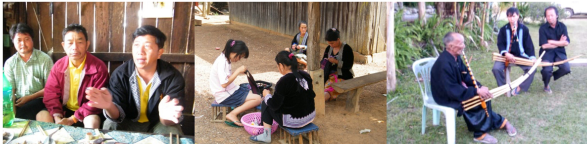
Figure 3. Interview with local Hmong ethnic people and observation of their traditional activities. Left : Casual interview with the local people. Middle : Traditional textile weaving by women of different ages. Right : Casual musical performance using traditional musical instruments

In this period, the residential areas of Hmong ethnic group became more interesting in terms of the beautiful landscapes and natural environment. The areas have been turned from a battlefield into a popular tourism area, attracting loads of tourists from Thailand or, even, around the world. The tourism industry and economy of Khao Kho district then rapidly grew. Therefore, the unavoidable influences from the active tourism business and growing economic prosperity, including construction of accommodations, i.e. hotels and resorts, and introduction of public or private transportation, would eventually affect the roots of original society and culture of the ancestral Hmong ethnic group. Various factors, including agricultural activity, animal domestication, folk belief, tradition, music and lifestyle were significantly disregarded and became less important over time. Self-adaptation to meet life basic needs became more vital in order to synchronize with the modernized world. Globalization and technological development have directly affected Hmong ethnic group's society and culture and the local Hmong culture has become more overlooked.