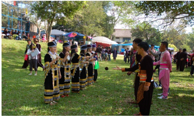
Figure 5. 'Yone Look Chuang' ceremony performed by male and female teenagers