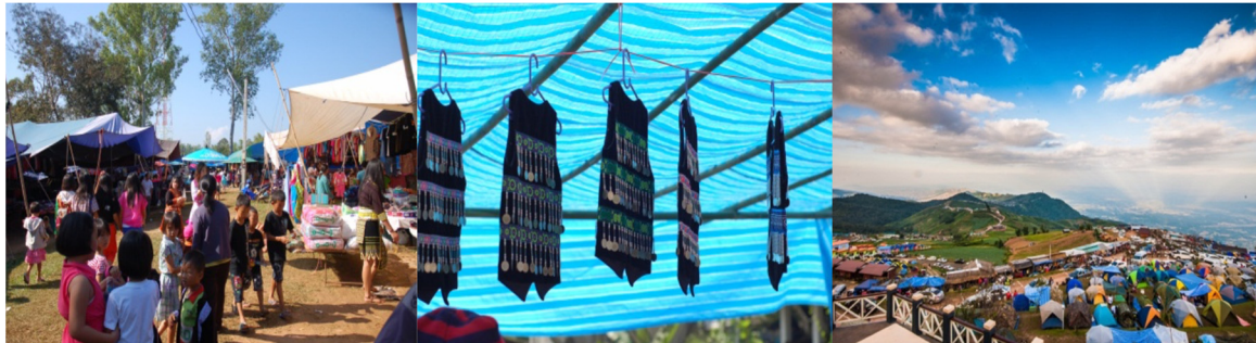
Figure 4. The rapid growth of tourism industry in Khao Kho District, Phetchabun Province

For the religious and ideological factors, in the past, Hmong ethnic group living in Khao Kho District, Phetchabun Province believed in superstitions and predecessors. Later, Christianity became more popular in the area and, then, followed by the predominance of Buddhism. As a result, there have been the diversity of beliefs in Khao Kho community. The appearance of architecture that symbolizes different religions is situated in Khao Kho area such as spirit houses, Christian churches, and Buddhism temples. Changes in religion and ideology directly influence people's belief at a great extent, so the social and cultural changes would concomitantly occur in a community.