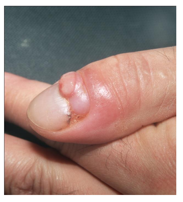
Fig. 3. Retronychia with inflammation of the proximal nail fold, onychomadesis and formation of proximal granulation tissue

(22%), and Beau's lines (11%). In one case, the affectation of the index, middle and ring fingers after an automobile accident was described [20]. In another series, the first toe was affected in all cases, and bilaterally in 6/20 (30%), with an evolution time of 5 months on average [5]. In a series of 21 cases of acquired great toenail dystrophy, 2 cases presented retronychia, showing onychomadesis, onycholysis, loss of cuticle and yellowish chromonychia [21].