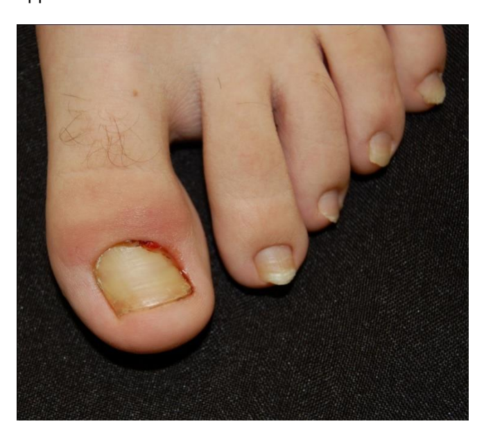
Fig. 1. Proximal nail fold with erythema in a case of short evolution

with changes in its coloration, with a yellowish tone (Fig. 2), especially in chronic cases (due to thickening of the nail plate, laminar formations, pronounced onycholysis [19] and formation of inflammatory exudate that accumulates under the nail). Its base is higher than the distal edge [1]. The formation of granulation tissue is common in about one third of cases [4] at the junction of the proximal fold with the lateral ones, which is not usual in classic onychocriptosis, in which it is distal and lateral.