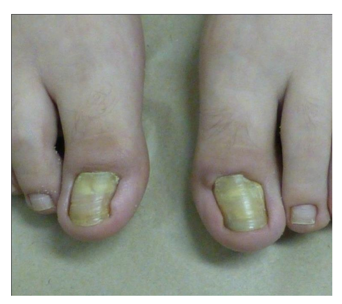
Fig. 2. Yellowish and thickened nails in a long-standing case of retronychia. Lateral and proximal nail folds show irregular and inflamed contours