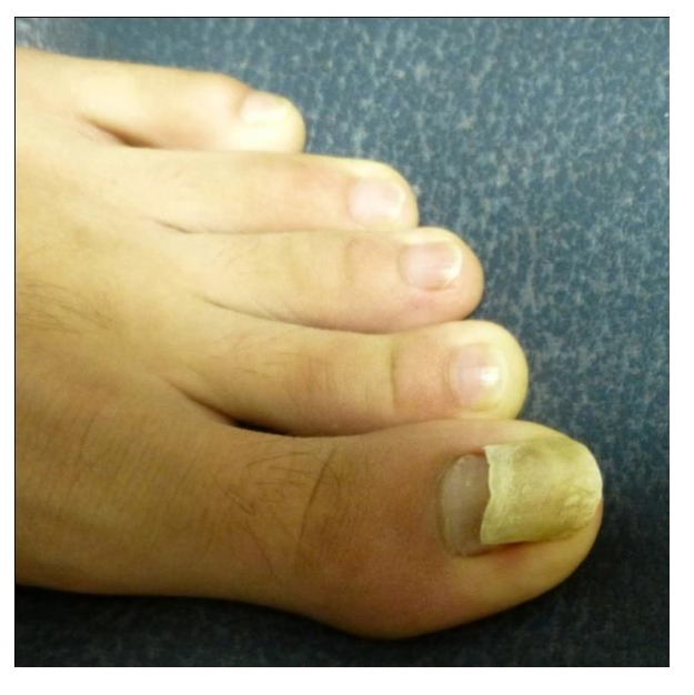
Fig. 4. Detachment of the nail plate towards proximal in a case of rethonychia not treated