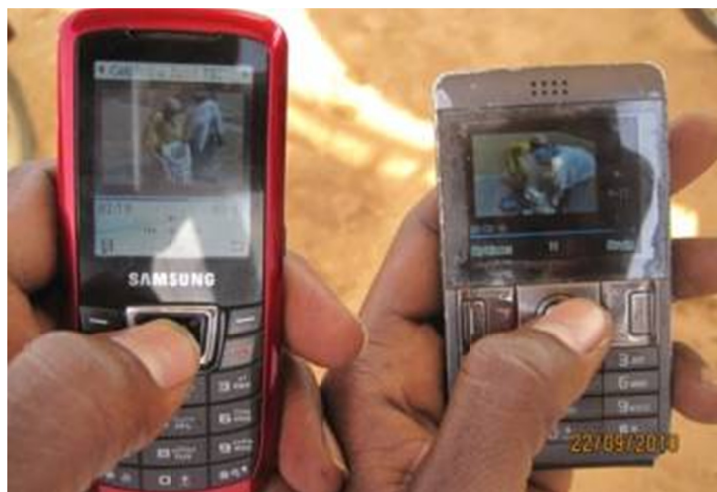
Figure 1. Representation of feature phones used to transfer and watch PICS videos via Bluetooth wireless technology (BWT)

Six months after disseminating the PICS videos, 60 randomly selected participants (representing 45% of those who received the PICS video) were interviewed. Sample selection was stratified based on the proportion of the number of participants from each district and community. A questionnaire was developed and had both open and close-ended questions. Data collected included socio-demographic characteristics of respondents, how they received the PICS video, how many times they had watched and shared it, and its usefulness. The evaluation included the usefulness of PICS videos among respondents, and other potential areas of application (health, crop production, etc.).