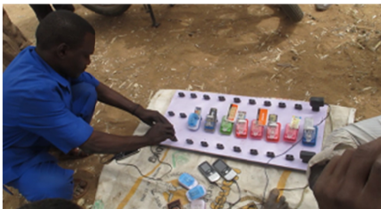
Figure 3. A cellphone charging station in rural Zinder, Niger (2015)

Ownership of mobile phones (average of 25 per community) was low compared to other countries (Baributsa et al., 2010; Quandt et al., 2020). This low estimate was due in part to a low presence of household members during the visits of the extension agents. Based on the most recent data, it is clear that cellphone ownership has significantly increased in the last decade with more than 50% of households in a community having a mobile phone (Krell et al., 2021; Quandt et al., 2020). This rapid increase in mobile phone ownership in rural communities can be attributed to the lower cost of the devices, improved network connectivity, access to electricity, and power-efficient devices (Ayim et al., 2020; Houngbonon, Le Quentrec, & Rubrichi, 2021; Phillips et al., 2011; Wyche & Olson, 2018). In addition, improved access to energy sources (solar, generator, etc.) and services (cellphone battery charging outlets- Figure 3) have helped increase cellphone ownership and use in rural communities. Increased cellphone ownership should make it easier for farmers and others to access information on their devices.