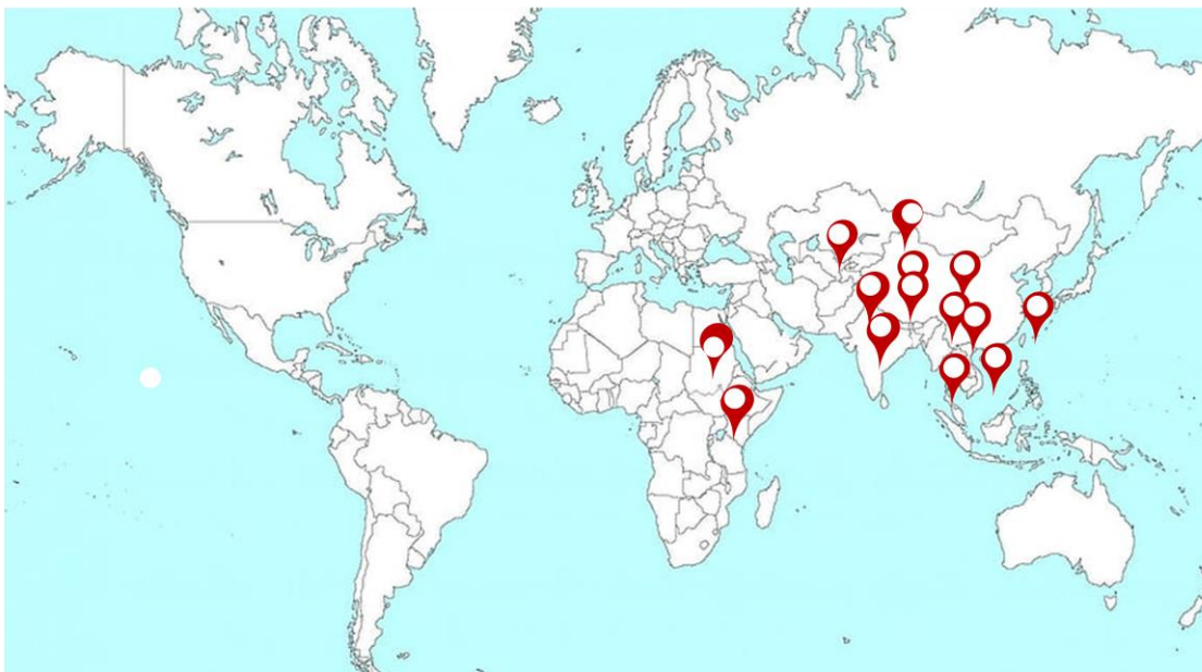
Fig. 1. Distribution of wood apple in world

South India, Sri Lanka, Nepal Bangladesh Pakistan, Indo-China, Philippine Islands to West Africa, Northern Malaysia, Indonesia and Western Himalaya regions