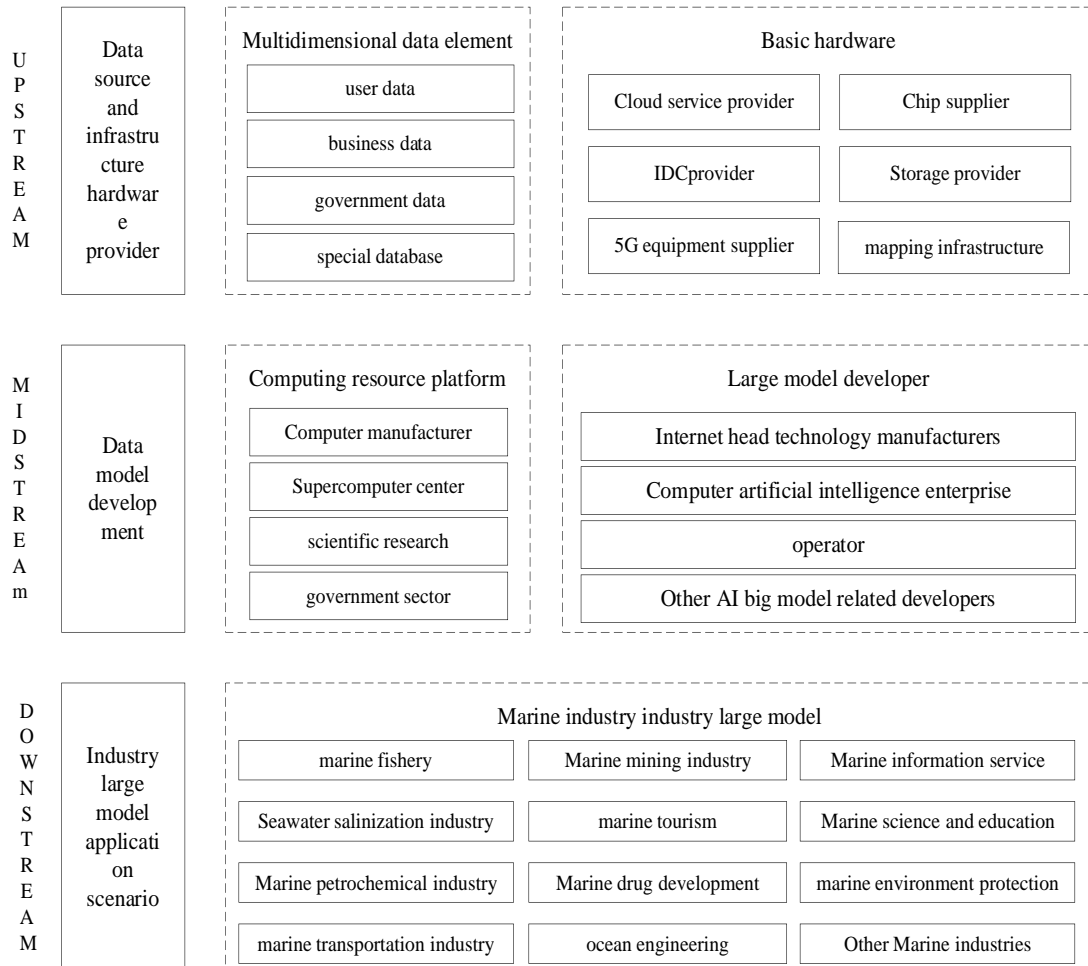
Fig. 1. Overall view of the large model of the Marine industry