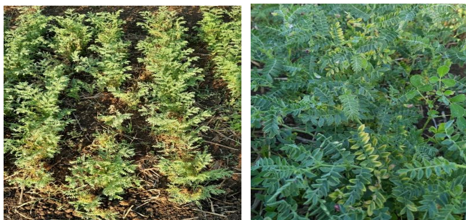
Fig. 2. Plant injuries observed in the field by (T1) Topramazone treatment