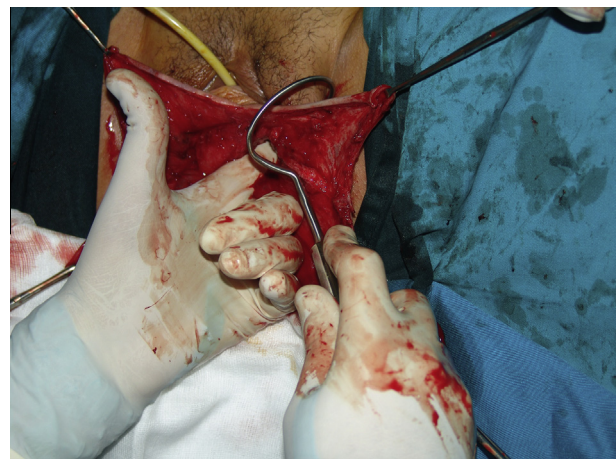
Figure 3 The needle is introduced after a skin incision is made in the genito-crural line at the level of the urinary meatus, controlled by surgeon, below the ischiopubic ramus, punching it through the obturator membrane and externalising it through the vaginal incision (left side).