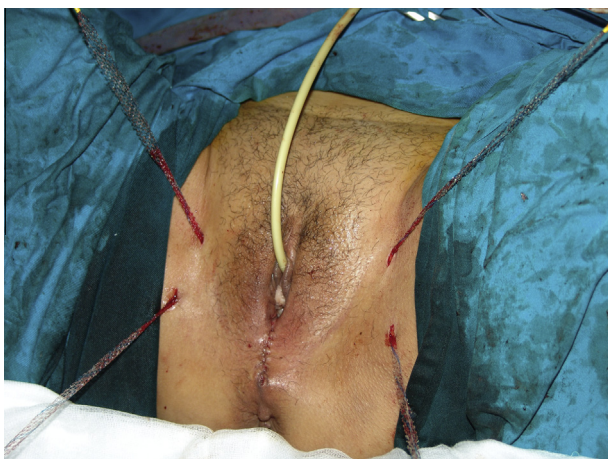
Figure 5 The final aspect before the mesh arm section.

from the incisions. The implant must cover the entire dissected area. The arms are then adjusted and tightened in a tension-free fashion, considering the postoperative retraction of adjacent tissues. The prosthesis is fixed at two points with non-absorbable sutures placed in the pubic insertion of the levator. The portion of the vaginal section is closed by a running polyglactin 1/0 suture with no colectomy. The procedure is completed by the mesh arms section (Fig. 5).