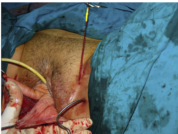
Figure 4 A second incision is made 3 cm inferior and 2 cm lateral to the superior incision. The needle is equipped in the same way as before, and is introduced inwards under finger guidance (left side).