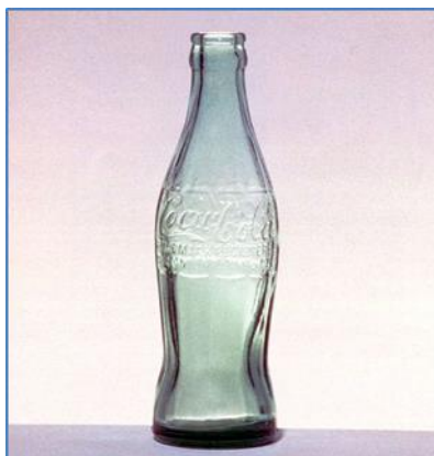
Figure 1. Classic Coca Cola Bottle

Classically, semiotics , the scientific study of the signs of meaningful objectification, provides a body of evidence of media culture practices whereby women continue to face discrimination from their sexuality: being disallowed the privilege of emotional assurance and celebration of advancements in sexuality discourse. They are fed instead, stereotyping, sexualised symbolisms and classically conditioning towards sexual pleasures and sexual function (Bettany & Woodruff-Burton, 2008). One needn't look further than late American industrial designer Raymond Loewy's "aggressively female", classic Coca Cola bottle design from 1955 (Figure 1).