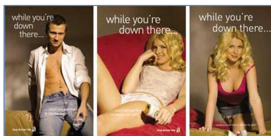
Figure 8. Keep Britain Tidy (2005)

The sarcasm derives from the juxtaposition of the female sexual organ to the associated message, intelligence. This video aims to foster open discussions of sexism in male-dominated environment on issues objectification, enabling both genders to acknowledge discriminatory practices stemming from sexist attitudes.