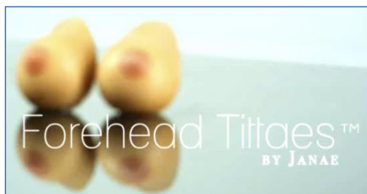
Figure 7. Funny or Die (2010) Forehead Tittaes

On comedy video website Funny or Die (2013), French actress and singing celebrity Marion Cotillard performed in a viral video introducing a ‘product’ called Forehead Tittaes (2010), sticking false miniature breasts on her forehead as a bid for women to be respected in the workplace (Figure 7). Using meme humour, the message delivered is by attracting the male gaze from their bosoms to the forehead area, closer to the eyes.