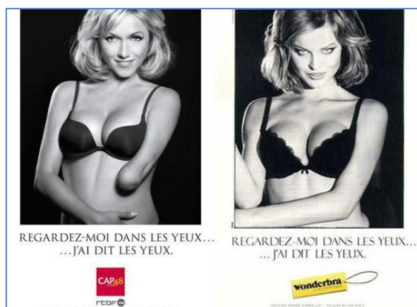
Figure 5. A non-profit disability awareness campaign

Further on the hyper-sexism paradigm, the 2006 print advertising for Tom Ford for Men male fragrance delivered explicit images of a fragrance bottle juxtaposed as a play object wedged between breasts, covering naked female genitalia (Figure 4), overtly suggesting that applying the fragrance enhances a user's masculinity and dominance, while identifying the male need for erotic arousal to be fulfilled through objectifying women. The semiotic visual offence that objectified the female model's parts was achieved through juxtaposing standards of perfection (tanned, waxed and blemish-free skin, ruby red nails, slim fingers and open lip pout) accentuates the product's immediacy and signified unapologetic right "to sell sex" for those who have "knowing" tastes (Stankiewicz & Rosselli, 2008). Despite complaints to the UK Advertising Standards Authority (ASA), accusations of masked degradation through such blinding "male gaze" adverts were nevertheless deflected by the company, claiming that the specific segment of culture magazine readers were unlikely to be offended, while its merit was considered a "stylistic", glamorous tribute to image-making, which the ASA eventually acceded to (Allwood, 2015).