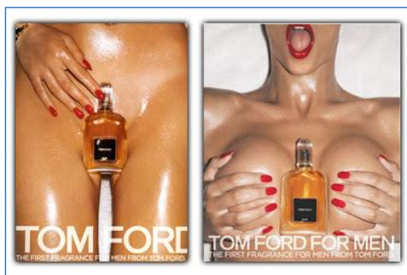
Figures 4. Tom Ford for Men

While the female organ per se was blocked out with a white banner to avoid accusations of objectification, the crassness of the image creates direct offensiveness that require neither explanations nor justification of aesthetics in the postfeminist era where issues such as pornography have become mainstream social concerns (The Guardian, 2015).