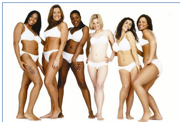
Figure 6. Dove's Campaign for Real Beauty 2004

As argued earlier in the paper, consumer marketing research shows that specific imageries and textual attributes found in advertising that represent the ideals of sexuality, are invariably linked to cultural characteristics (Reichert & Lambiase 2001). In its highly-touted viral advertising cum social experiment, the Campaign for Real Beauty (2004) Unilever brand Dove avoided the use of thin stereotypes, instead featuring normal weight ranges among underwear-clad models, in hope that female customers will identify with the projected images of innate or natural beauty (Figure 6).