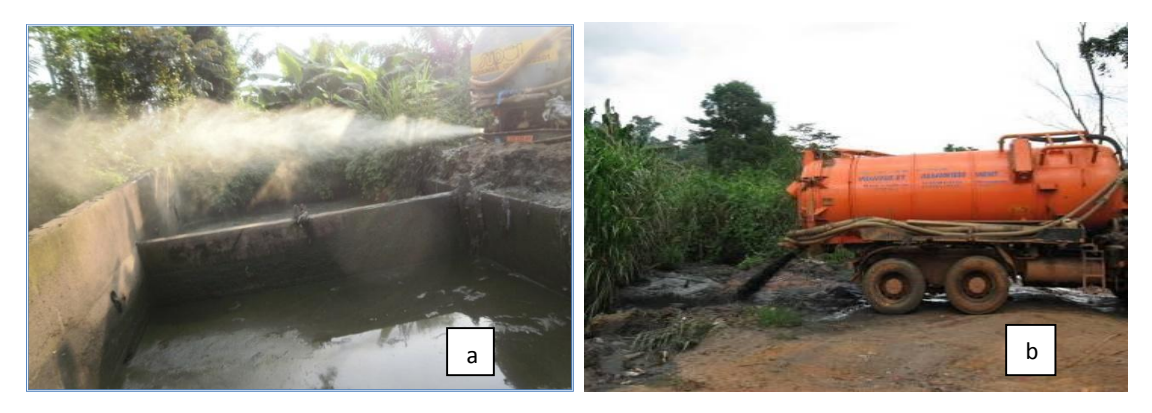
Fig. 1. Partial view of two types of faecal sludge disposal systems at Nomayos, Yaounde. (a) discharge into a well, (b) direct discharge on the ground

S0: control, S1: before discharge point, S2: discharge point, S3: after discharge point The number of germs for lettuce is expressed in CFU/100 g of leaves